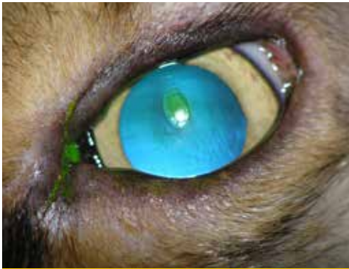
Figure 11. Fluorescein test in a 9-year-old mongrel dog. Fluorescein dyes the corneal stroma at the wound area and the surrounding detached epithelium, less intensely. Typical picture of an indolent corneal ulcer.