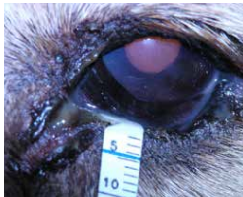
Figure 6. Findings of the STT in a 7-year old Griffon dog. Left eye values: 21 mm. Left eye values: 2mm. Please note other KCS symptoms present (corneal oedema, vascularization and mucopurulent discharge).