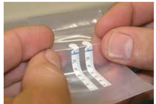
Figure 2. Prior to opening the envelope, the strips are bent to the point of the notch in order to facilitate their apposition in the conjunctival sac.

Corresponding author: Placentia Veterinary Clinic Al. Panagouli 31 and Viotias 15343, Ag. Paraskevi. liapis@plakentiavet.gr Tel. 2106082309