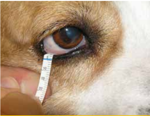
Figure 3. Initially, any mucus secretion is gently removed from the eyelids and conjunctival sac without excessive handling or liquid rinsing. The lower eyelid is then pulled down and the end of the strip that has been bent at the notch is placed in the lower conjunctival sac of the lateral half of the eyelid. The notch should be placed at the free edge of the eyelid.