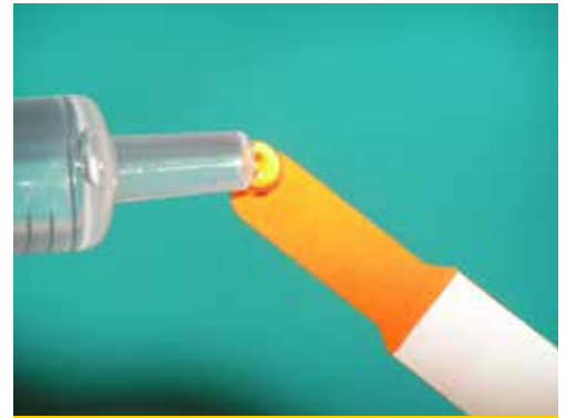
Figure 8. Initially, a drop of saline solution is placed at the end of the impregnated strip.