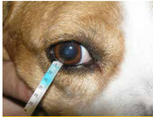
Figure 4. The lower lid is allowed to come into position dragging the edge of the strip. In animals with difficulties in strip apposition, the eyelids may be held closed during the examination without affecting the test result. The strip is left for a minute and is then removed. Assessment should be made immediately since wetting of the strip can continue for a while.

practice, STT I is used commonly as it does not require local anesthesia. STT I measures both basic and reflex tear production. Normal values in the STT I range between 18.64 \pm 4.47 mm/min and 23.90 \pm 5.12 mm/min in the adult dog and 14.3 \pm 4.7 mm/min and 16.92 \pm 5.73 mm/min in the adult cat, although feline KCS is uncommon. In dogs, values lower than 5 mm indicate severe KCS. Values 5-10 mm indicate KCS while 10-15mm raises suspicion of the disease and should be eval-