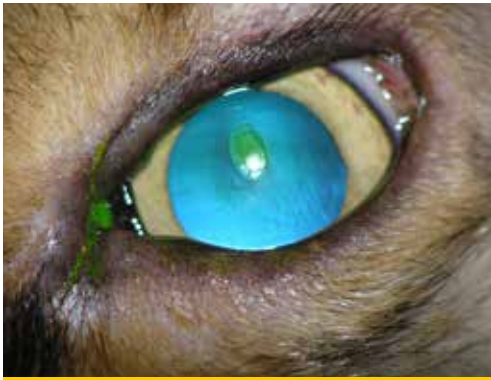
Figure 11. Fluorescein test in a 9-year-old mongrel dog. Fluorescein dyes the corneal stroma at the wound area and the surrounding detached epithelium, less intensely. Typical picture of an indolent corneal ulcer.