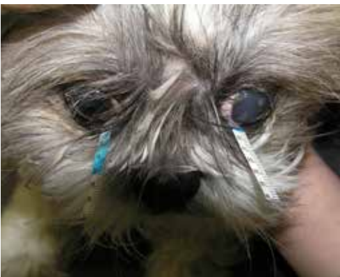
Figure 5. Evaluation of STT results in a 5-year old Shih-Tzu dog. Right eye, normal values: 21 mm. Left eye: 6 mm. Note also, on the left eye, the other symptoms of KCS (corneal oedema and mucopurulent discharge).

uated in association with other clinical symptoms. The STT precedes the ophthalmic examination to avoid the induction of reflex tears due to handling, and before the topical use of other diagnostic solutions. Prior to re-examinations, topical application of ophthalmic solutions should be avoided. Before the test, any mucus discharge that may be present on the eyelids and conjunctival sac is gently removed without excessive handling or liquid rinsing.