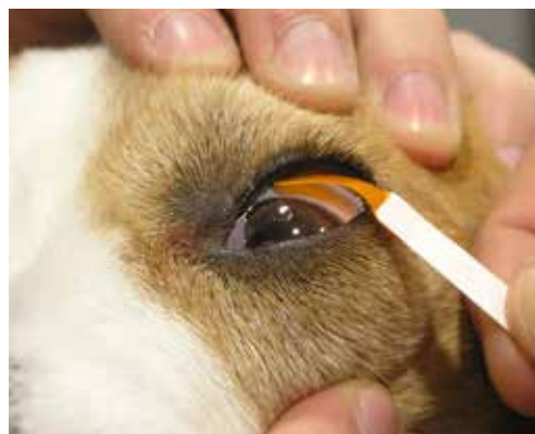
Figure 9. The upper eyelid is pulled up and the impregnated strip is attached to the bulbar conjunctiva. Avoid contact of the strip with the cornea, as it may cause epithelial abrasions and false-positive results.

520 nm (green light). For this reason, its visualization is easier when illuminated with blue light. Fluorescein is highly lipophobic and hydrophilic and thus not normally absorbed by the corneal epithelium because of fat contained in the cell membranes. With the occurrence of epithelial damage, fluorescein is absorbed by the corneal stroma giving the characteristic green colour. Fluorescein is not absorbed by Descemet's membrane. Consequently, only the periphery of a pre-Descemet ulcer is stained rather than its bottom.