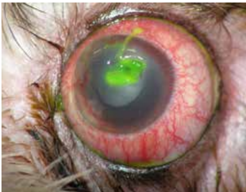
Figure 13. Fluorescein test of a 6-year-old Lhasa Apso dog. Inadequate rinsing of the eye after fluorescein use, complicates the test assessment. An amount of stained mucus is not removed from the ulcer; hence, it is difficult to identify its exact depth and extent. In addition, a part of the mucus extends to the upper cornea, giving false-positive results.