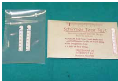
Figure 1. The STT is performed using standard filter paper strips 5 X 35 mm with a notch 5 mm from its end, lined per millimeter, sterilized and packed in pairs. Some strips, such as the strip illustrated here, are impregnated with pigment in the notch for easier reading.

The Schirmer tear test (STT) estimates the aqueous phase of tears. Hence, it is used for diagnosing keratoconjunctivitis sicca (KCS) and quantitative KCS, in particular. Diagnosis of qualitative KCS is established using other tests. In clinical