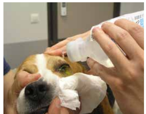
Figure 10. Rinse the corneal surface and conjunctival sac with normal saline in order to remove excessive dye. Fluorescein may be attached to mucus, hair and debris and could lead to false-positive results.