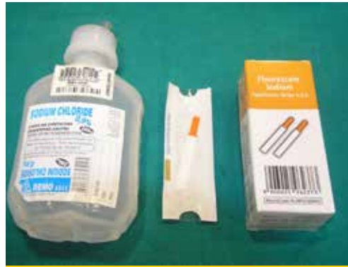
Figure 7. Fluorescein test using strips impregnated with dye and saline solution.