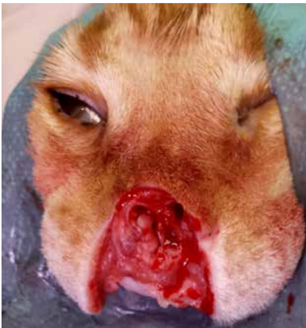
Figure 8. Cat of figure 3. Nosectomy with upper lip excision was performed.