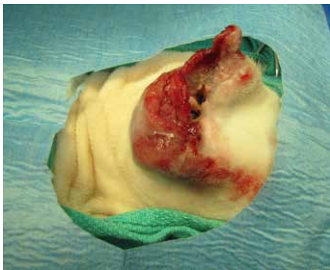
Figure 1. Invasive squamous cell carcinoma of the right pinna in a cat. Wide pinnectomy and total ear canal ablation was performed in this case to achieve adequate surgical margins.

are affected. 1 Siamese are very rarely affected, possibly due to their dark coloured skin. 1,2 Overall, cats with white or lightly pigmented skin that spend most of their time outdoors exposed to ultraviolet light are predisposed to the development of SCC. 1,2 Papillomavirus infection has been associated with multicentric SCC in situ but there is limited evidence that it constitutes a risk factor for the development of SCC. 3,4