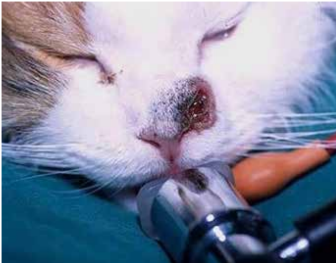
Figure 2. Invasive squamous cell carcinoma with ulceration of the left site of the nasal planum in a DSH cat.