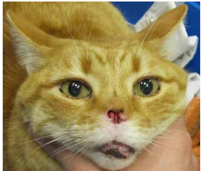
Figure 13. Postoperative "phantom of the opera" appearance of the cat of figure 3 two months after surgery.