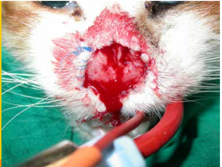
Figure 10. Cat of figure 3. Immediate postoperative appearance following nosectomy and upper lip excision. Closure was performed using simple interrupted 4/0 nylon sutures to get the nasal mucosa and the skin into close apposition. Upper lip reconstruction using a two layer closure also was performed.

Figure 9. Cat of figure 2. Immediate postoperative appearance following nosectomy and upper lip excision. Closure was performed using a purse string 4/0 polypropylene suture.