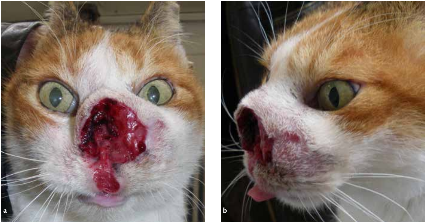
Figure 4 a & b. Very invasive and destructive SCC of the nasal planum and upper lip in a DSH cat.

lupus erythematosus (Figure 5). 1,2,4,8 However, the appearance and distribution of accompanied skin lesions along with possible systemic clinical signs can help in differentiating the above immune-mediated diseases. In all other cases, the history and other diagnostic procedures, especially skin biopsy, can confirm diagnosis.