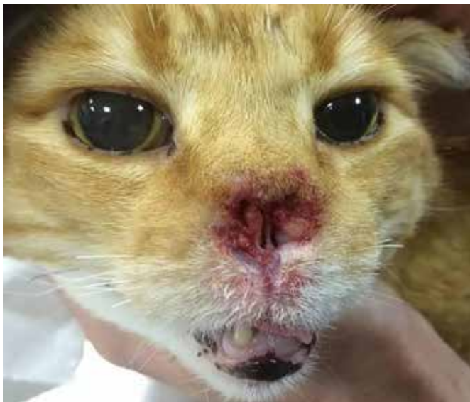
Figure 12. Postoperative appearance of the cat of figure 3 four weeks after surgery following suture removal.