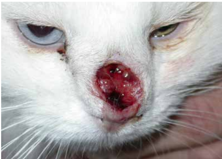
Figure 5. Cryptococcus infection in a DSH cat.

Tumour staging should be implemented before surgical treatment. Complete staging of nasal planum tumours includes hematological and serum biochemistry examination, cytological examination with fine needle aspiration of regional lymph nodes and thoracic radiographs.