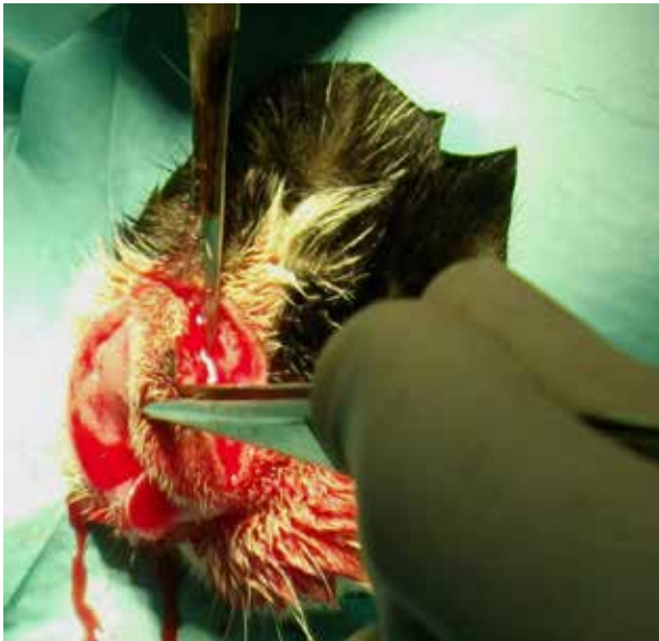
Figure 7. The nasal planum is resected by angling the blade at a 45°.

between the cartilage and bone represents the deep surgical margin. A full thickness skin incision is made using a No. 15 blade around the planum and the tumour. Normally a small portion of skin and buccal mucosa are preserved ventrally to the philtrum if the tumour does not extend to the lip margin. The whole nasal planum along with deeper cartilage and turbinates are resected by angling the blade at 45° (Figure 7). 10 Haemorrhage is profuse but can be controlled by applying digital pressure. Following nosectomy, the skin edges retract and the conchae are visible (Figure 8). Excisional biopsy is recommended for suspicious areas of tumour infiltration. Two methods of