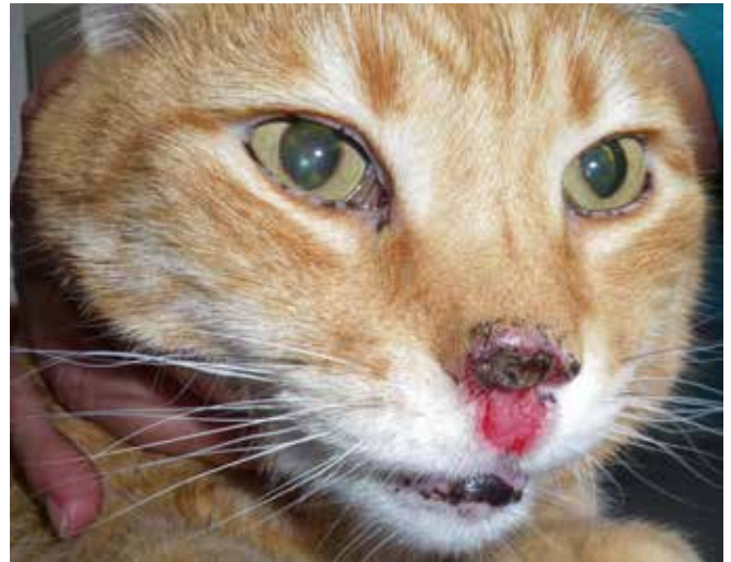
Figure 3. Invasive and ulcerative squamous cell carcinoma affecting the nasal planum and upper lip in a DSH cat.