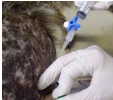
Figure 12. The butterfly catheter is penetrating the skin and it is inserted perpendicular to the lateral thoracic wall.