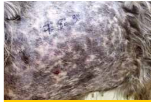
Figure 5. The area around the 7th to 9th intercostal spaces is clipped extensively.

length of the width of three intercostal spaces anterior to the 7 th and posterior to the 9 th intercostal space. The upper limit of the clipped area is extended to the level of the transversocostal facet of thoracic vertebra and the lower limit just above of the sternbrae (Figure 5). If it is known that it is an air effusion and the dog is in a standing position the area clipped could be restricted regarding its lower limit since air accumulates at the upper lung fields. The opposite is followed in case of a fluid effusion. If PCP is performed prior to diagnostic imaging investigation of the case, which would have differentiated the type of the effusion, the area is prepared by following the above mentioned general rules regarding the upper and lower limits. Usually, if PCP is done prior to diagnostic imaging investigation it is preferred to be performed through the 7 th to 9 th intercostal spaces both right and left. As mentioned above an ointment with local anesthetic is applied (Figure 6a) or a subcutaneous lidocaine 2% infusion is performed (Figure 6b) and few minutes are allowed to pass by. Clipped area is aseptically prepared (Figure 7).