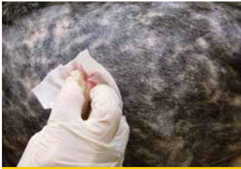
Figure 7. Surgical preparation of the skin.