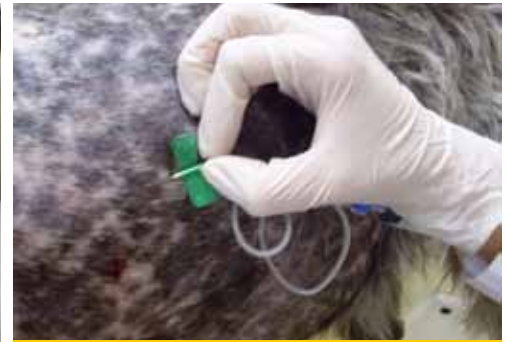
Figure 13. The needle of the butterfly catheter as soon as it is inserted to the pleural cavity is redirected so that its longitudinal axis to be located parallel to the thoracic wall.

possible to the shipment containers (for cytological evaluation, culture and biochemical analysis), while cytology smears are immediately prepared (Figure 16).