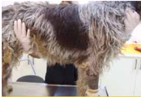
Figure 4. A dog is restrained in a standing position.