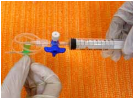
Figure 11. The butterfly catheter is attached to the three-way stopcock. One 10 ml syringe is plugged in to one of the catheter ports.