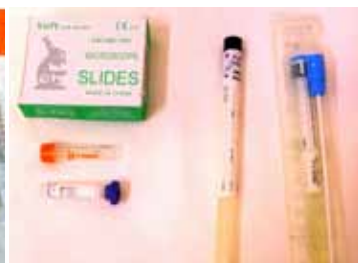
Figure 3. Materials needed for shipment of fluid effusion samples for measurement of protein concentration, counting of total nucleated cells number, preparation of cytological smears, and culture for aerobic and anaerobic bacteria and fungi.