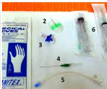
Figure 2. Material needed for pleural cavity puncturing, 1. Sterile gloves, 2. Butterfly 1.0 inch x 21G catheter, 3. Three-way stopcock, 4. Over the needle catheter, 5. Extension tube, 6. Syringes.