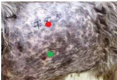
Figure 9. If it is an air effusion the point is located at the middle of the distance of the upper third of the intercostal space (red cycle), while if it is a fluid effusion the point is located at the upper limit of the lower third of the intercostal space (green cycle).

If it is a fluid effusion as soon as the 10ml syringe is filled the three-way stopcock is closed, the syringe is removed and a new one of the same or higher volume is fixed in place depending upon the volume of fluid expected to be aspirated. The content of the first syringe is splitted as soon as