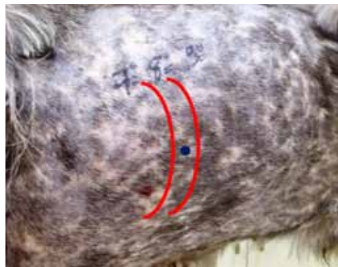
Figure 10. The point selected (blue cycle) should be in the middle of the two ribs (red lines) defining the intercostal space.