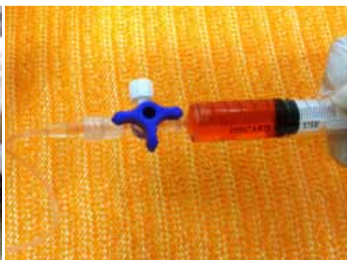
Figure 15. The syringe attached to the three-way stopcock starts to fill with the effusion fluid.