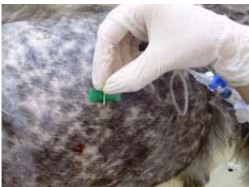
Figure 14. The butterfly catheter needle can be redirected, by moving clockwise provided that its longitudinal axis is always parallel to the thoracic wall.

In some cases despite the confirmed radiographic presence of fluid or air accumulation into the PC it is impossible to aspirate a satisfactory amount.