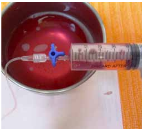
Figure 17. When the syringe is filled the passage of the valve with the butterfly catheter is closed and the syringe empties through the third passage of the valve to a container.