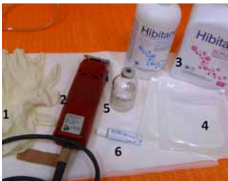
Figure 1. Materials needed for field preparation: 1. Gloves 2. Clipper 3. Antiseptic solutions for surgical preparation of the skin 4. Sterile gauze 5. Local anesthetic agent containing lidocaine 2% 6. Local anesthetic ointment (EMLA)

The animal is preferred to be placed in a position in which it seems to be more comfortable. Thus it can be restrained as gentle as possible in lateral recumbency or in a sitting or standing position. The author prefers to restrain the animal in a standing position (Figure 4). Lateral thoracic wall is clipped in an extended area around the intercostal space through which has been chosen to insert the hypodermic needle or butterfly catheter into PC. Specifically, the area that is clipped is extended at least at a distance equal to the