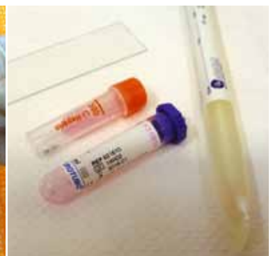
Figure 16. The effusion fluid is splitted to shipment containers.