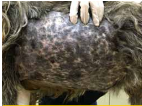
Figure 8. The person that is restraining the dog starts to count backwards from the 13th intercostal space to the forward until he reaches the intercostal space through that has been chosen. The counting is made at the upper boundary of the area prepared.

After identifying the selected intercostal space the person who handles the butterfly catheter chooses the exact point through which the catheter will enter into the PC. The height of the point chosen is based on the type of effusion. If it is an air effusion the point is located at the middle of the distance of the upper third of the intercostal space, while if it is a fluid effusion the point is located at the upper limit of the lower third of the intercostal space (Figure 9). Also, point selected should be in the middle of the two ribs defining the intercostal space in order to avoid rupture of vessels and nerves located to every rib (Figure 10). The butterfly catheter prior starting the procedure should already be connected to the three-way stopcock. In one of the three-way stopcock orifices a 10ml or 20ml syringe is attached (Figure 11). The butterfly catheter is hold in a way that after penetrating the skin and the intercostal muscles is inserted perpendicular to the PC (Figure 12). Then it is redirected so that the longitudinal axis of its needle to be located parallel to the thoracic wall (Figure 13), aiming to reduce the possibility of iatrogenic pulmonary parenchyma laceration.