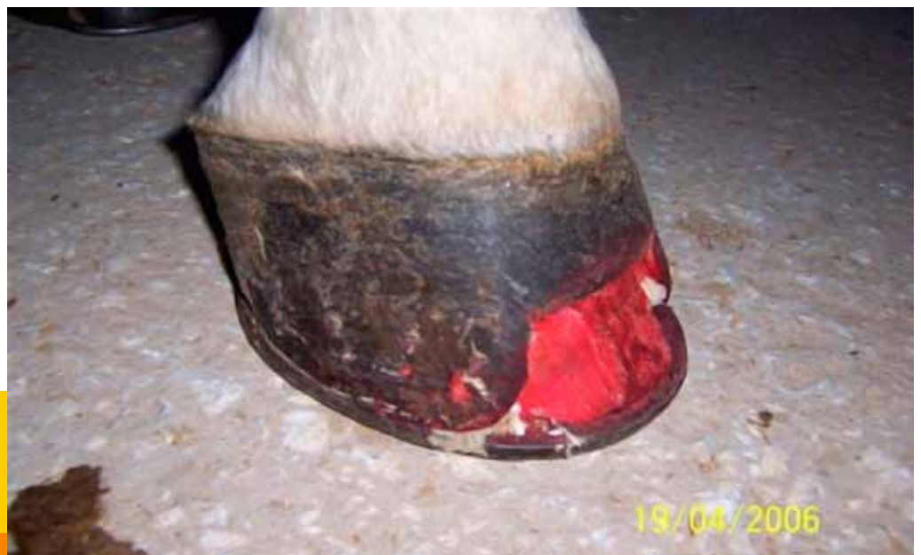
Figure 2. A typical presentation of white line disease, with visible inner layer, after the removal of the horny layer from the farrier.

cases hot shoeing was suggested. Fourteen horses were shod with an egg-bar shoe 9 and 30 horses with heart-bar shoe with or without silicone