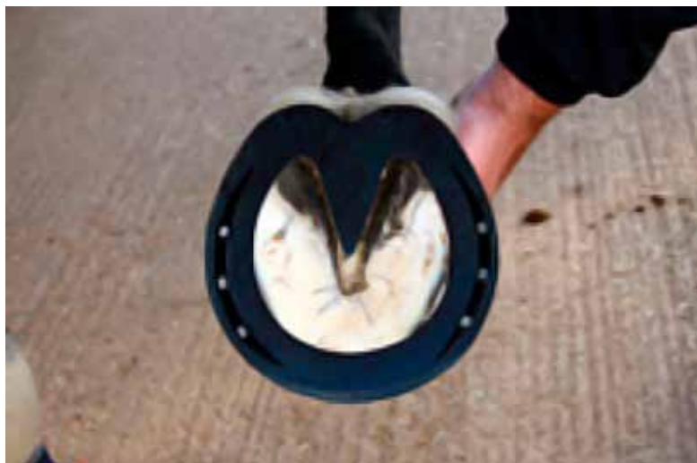
Figure 3. Heart-bar shoe.

frog pads (Figure 3). To stimulate hoof growth, cornuoscine ointment was applied on the coronary band once daily for one week and the daily ratio was supplemented with biotin (20mg SID per os for at least one month).